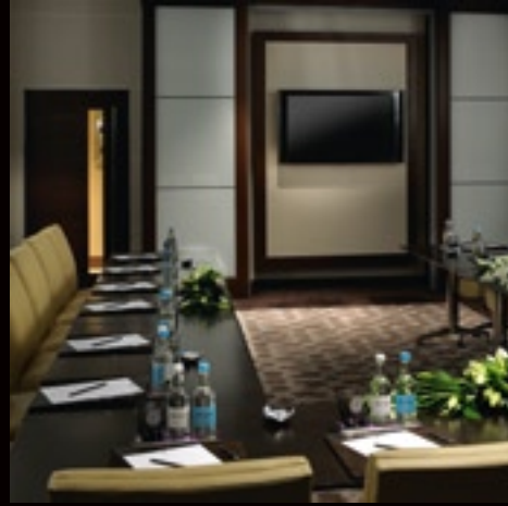
Izar Meeting Room