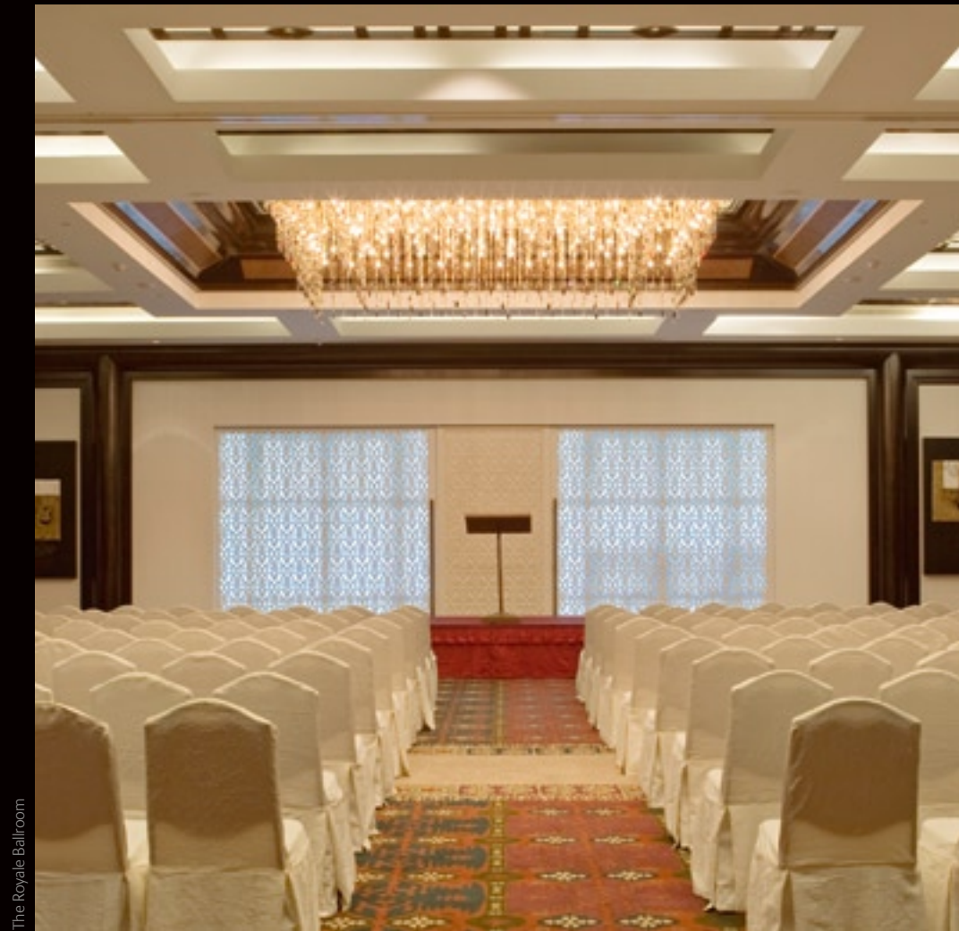
The Royale Ballroom