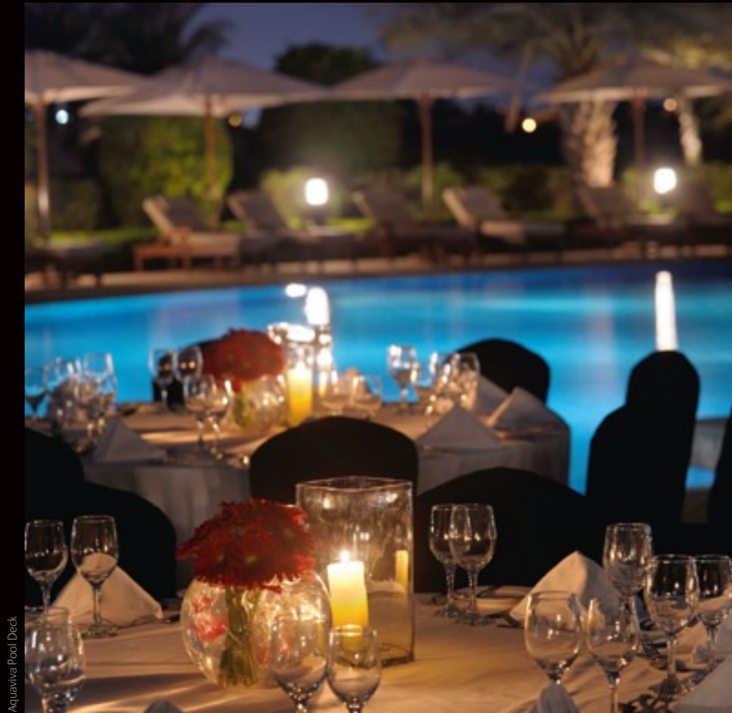
Aquaviva Pool Deck