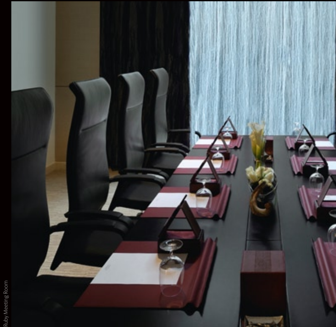
Ruby Meeting Room